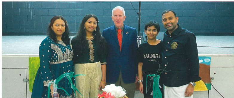
It was my pleasure to join members of Regina's Tamil community to commemorate Pongal, an annual harvest festival that celebrates prosperity and gratitude.

As your councillor, I strive to ensure that our community's interests are represented and upheld at all levels of governance. I have been actively engaged in advocacy work for the people of Regina on the boards of the Canadian Federation