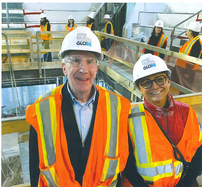
Earlier this year, I joined Regina City Council members on a tour to view the progress of the Globe Theatre revitalization project.

The Globe Theatre has long been a centre of cultural excellence in Saskatchewan and is the only theatre-in-the-round in Canada. As it undergoes a much-needed renewal project, the theatre eagerly anticipates the transformation that lies ahead.